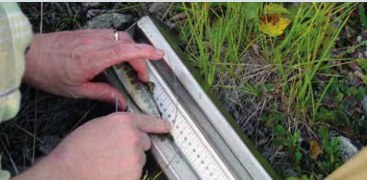
Photo: Eero Niemelä, Eevaliisa Kivilahti, VNIRO/ PINRO. Layout: Tikkanen Workshop

Despite implementation of stronger conservation and management measures, international and bilateral agreements to protect both salmon stocks and their habitats, the current situation for wild salmon stocks is alarming.