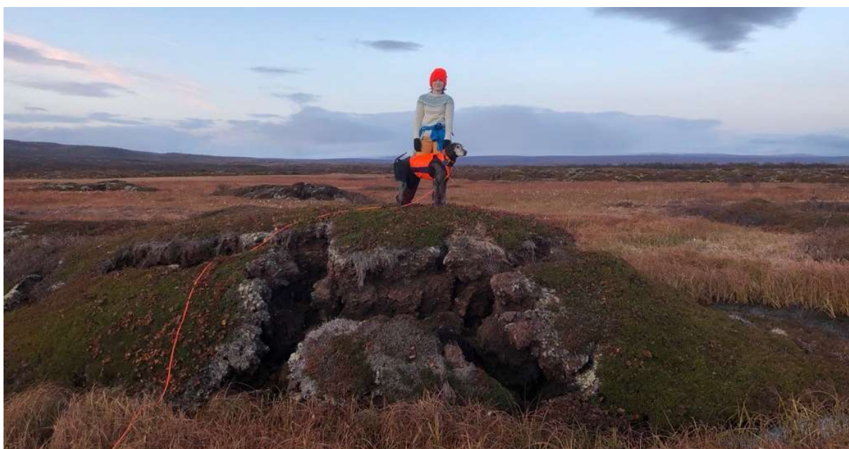
Photo 2. Palsa in 2019 (Mire near Vesterelv in Karlebotn).

Observing the physical “life” of a palsa reveals connections to climate parameters of different scales: global to microclimate effects. The vulnerability of palsa to anthropogenic effects is also interesting and important to analyse, often small and unexpected incidents from the view of humans can make huge impact on the palsa.